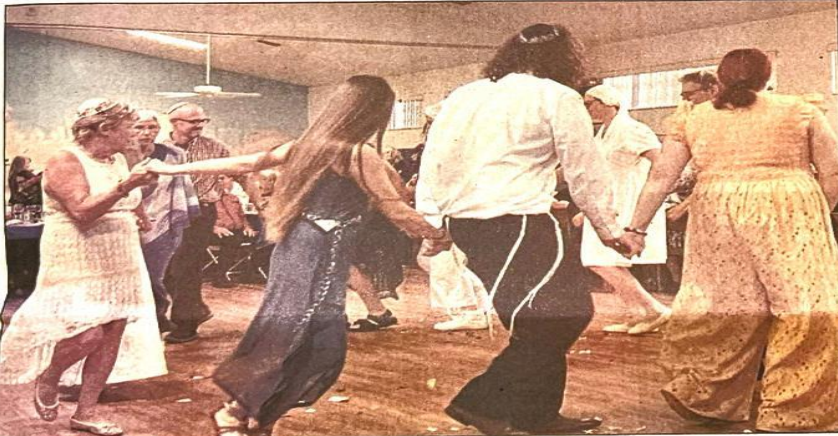
After the weddings last Saturday at Temple Israel, everyone enjoys an Israeli dance to "Hava Nagila."