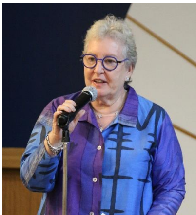
Bette Zaret Holocaust Education Initiative