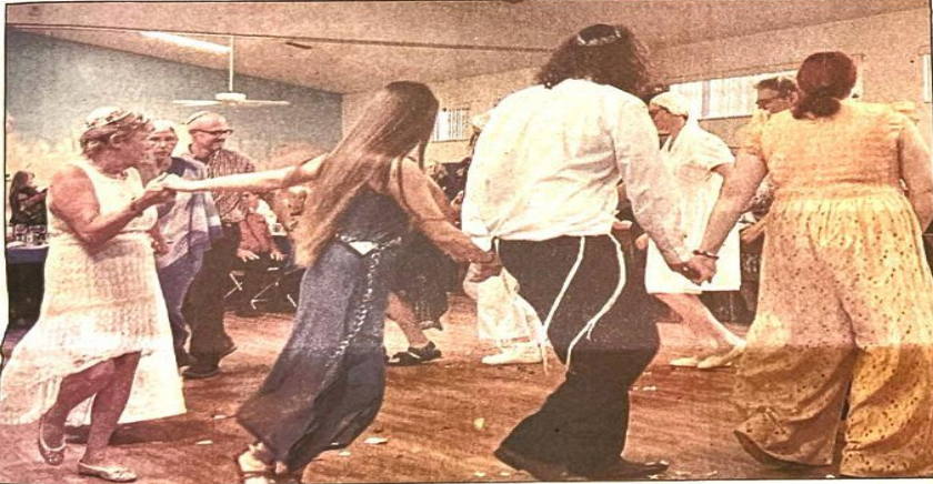
After the weddings last Saturday at Temple Israel, everyone enjoys an Israeli dance to "Hava Nagila."