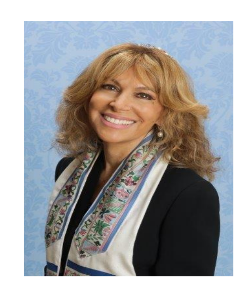
Future Erev Shabbat Services 6:30 PM (subject to change)

https://www.facebook.com/662042600572611/live/